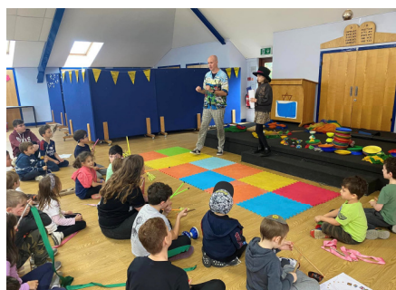
October Half Term Scheme 2022

Kaytana Summer Scheme welcomed 81 participants, with amazing trips to Go Ape and Inflatation. Workshops included kickboxing, bushcraft, and Magic skills. Our Hadracha course continues to thrive for those in year 9 and above, teaching many different skills in leadership and confidence as well as practical skills about being in the work environment, including creating activities and interview skills.