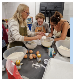
Honey Cake Cookalong 2022