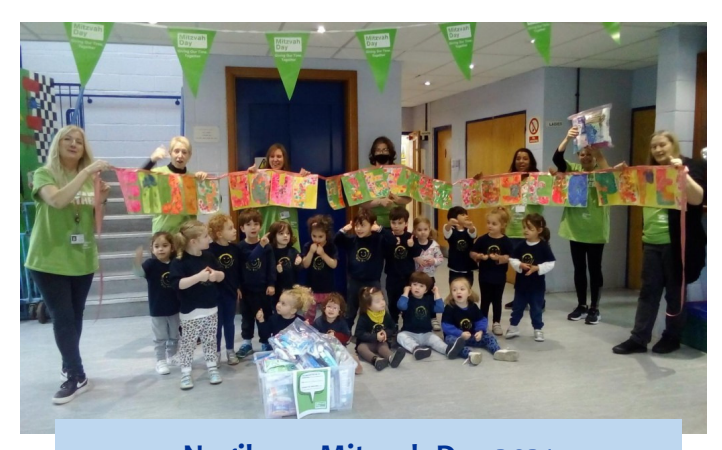
Nagila on Mitzvah Day 2021

NAGILA: Nagila used the academic year to explore the cycle of Jewish festivals and also enjoyed learning about different cultures. We have had continuous support and regular involvement from all members of the Rabbinical Team. We also work closely with the EHRS Young Families Lead to promote their activities to our families. Over the summer break the nursery was completely renovated and we returned in September with a new cohort ready to enjoy the enhanced space. In November we participated in the global event -Mitzvah Day, with parents and children working together to support a number of charities. We also participated in Just ONE Tree day and the parents fundraising efforts raised enough to plant a further 95 trees to contribute to global reforestation. Nagila is open to members and non-members alike and provides a warm introduction for many young families to EHRS.